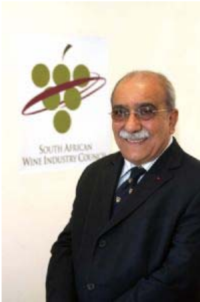
Professor Kader Asmal

Fragmentation is one of the major factors preventing the South African wine industry from reaching its full potential, says Professor Kader Asmal, the new chairperson of the SA Wine Council.